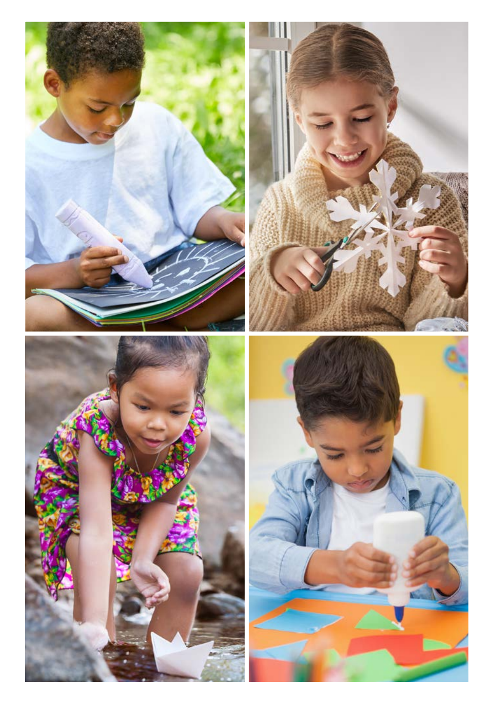
Paper can be fun!