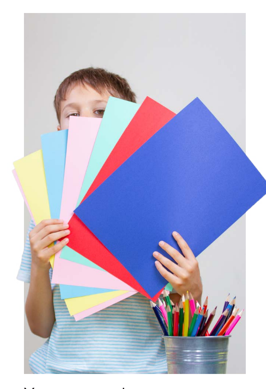
You can change paper.