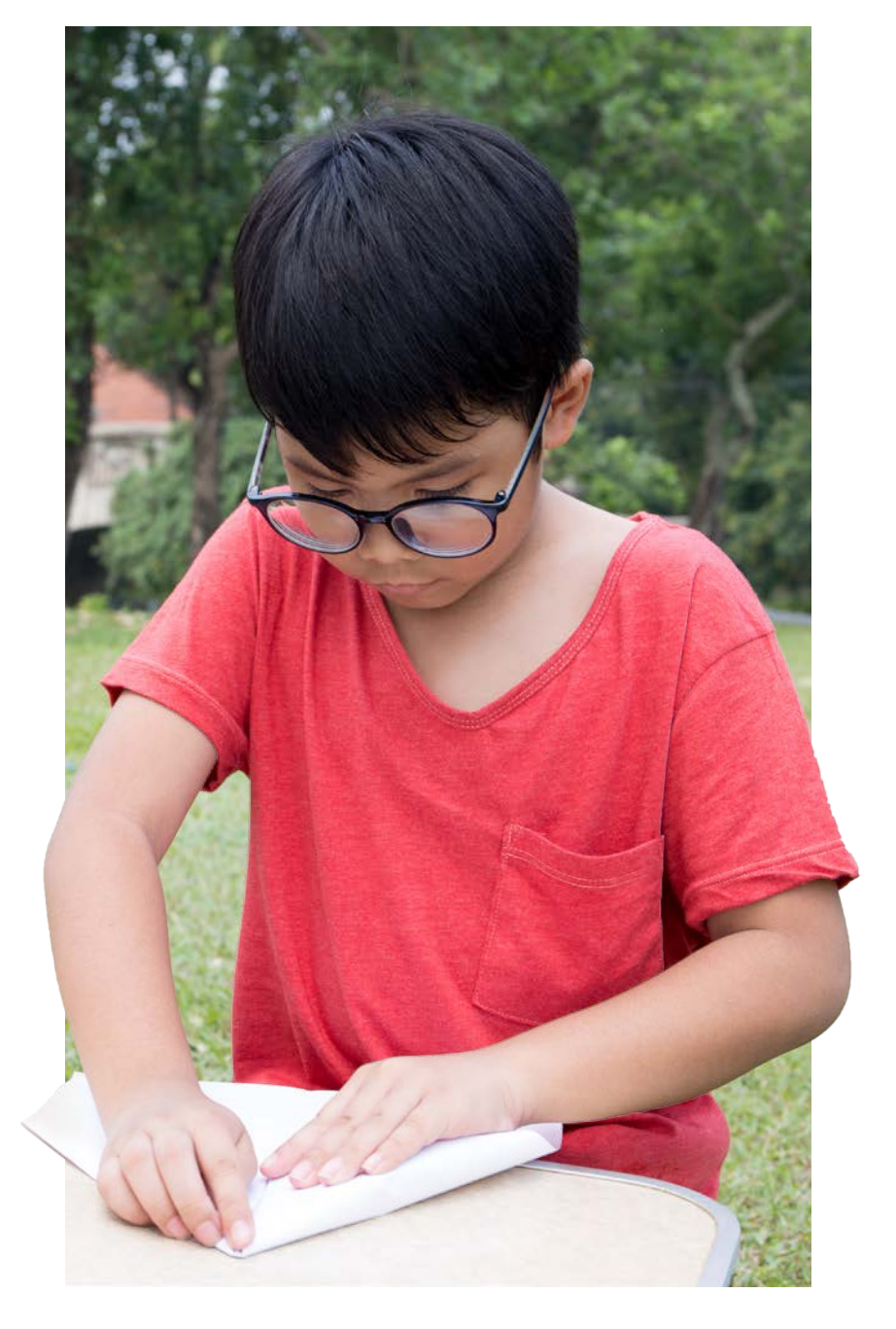
You can fold paper.