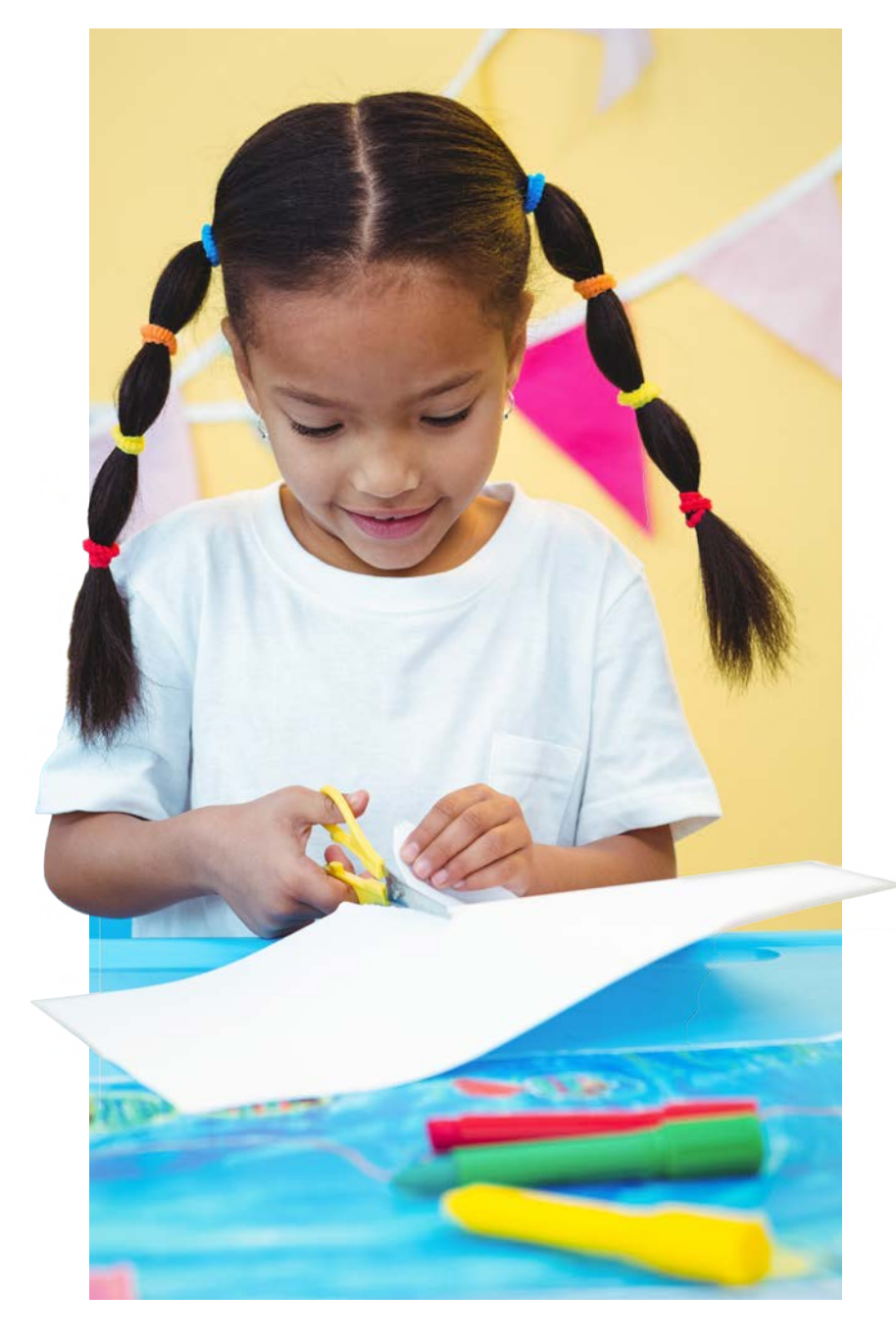
You can cut paper.