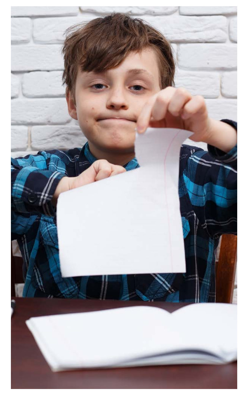
You can tear paper.