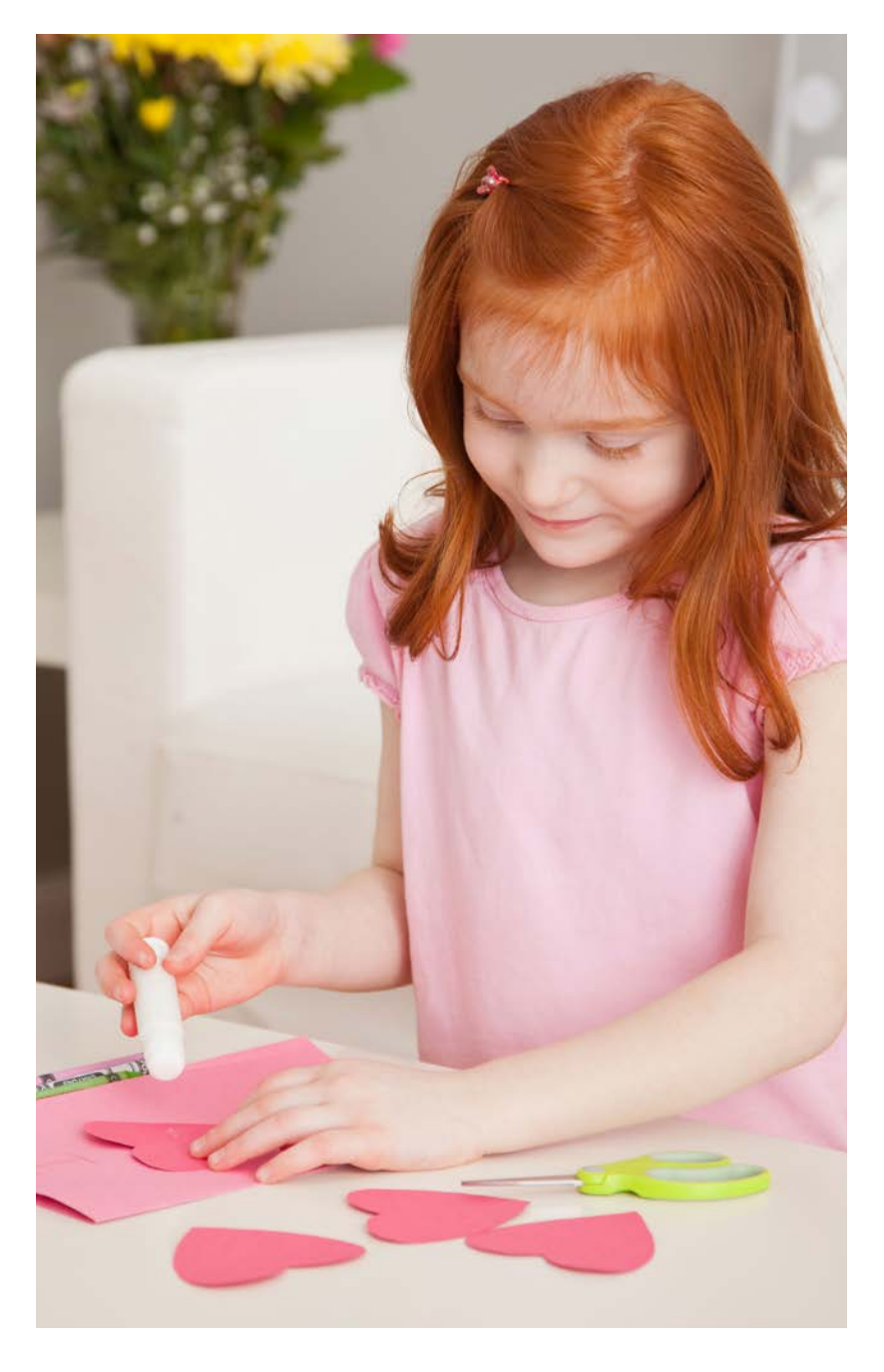
You can glue paper.