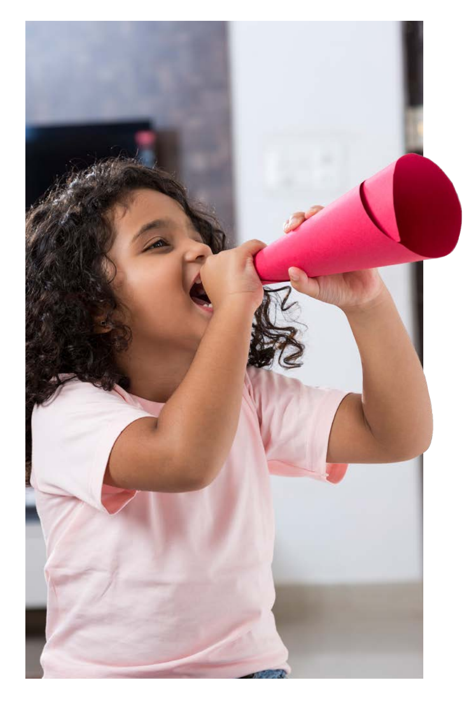
You can roll paper.