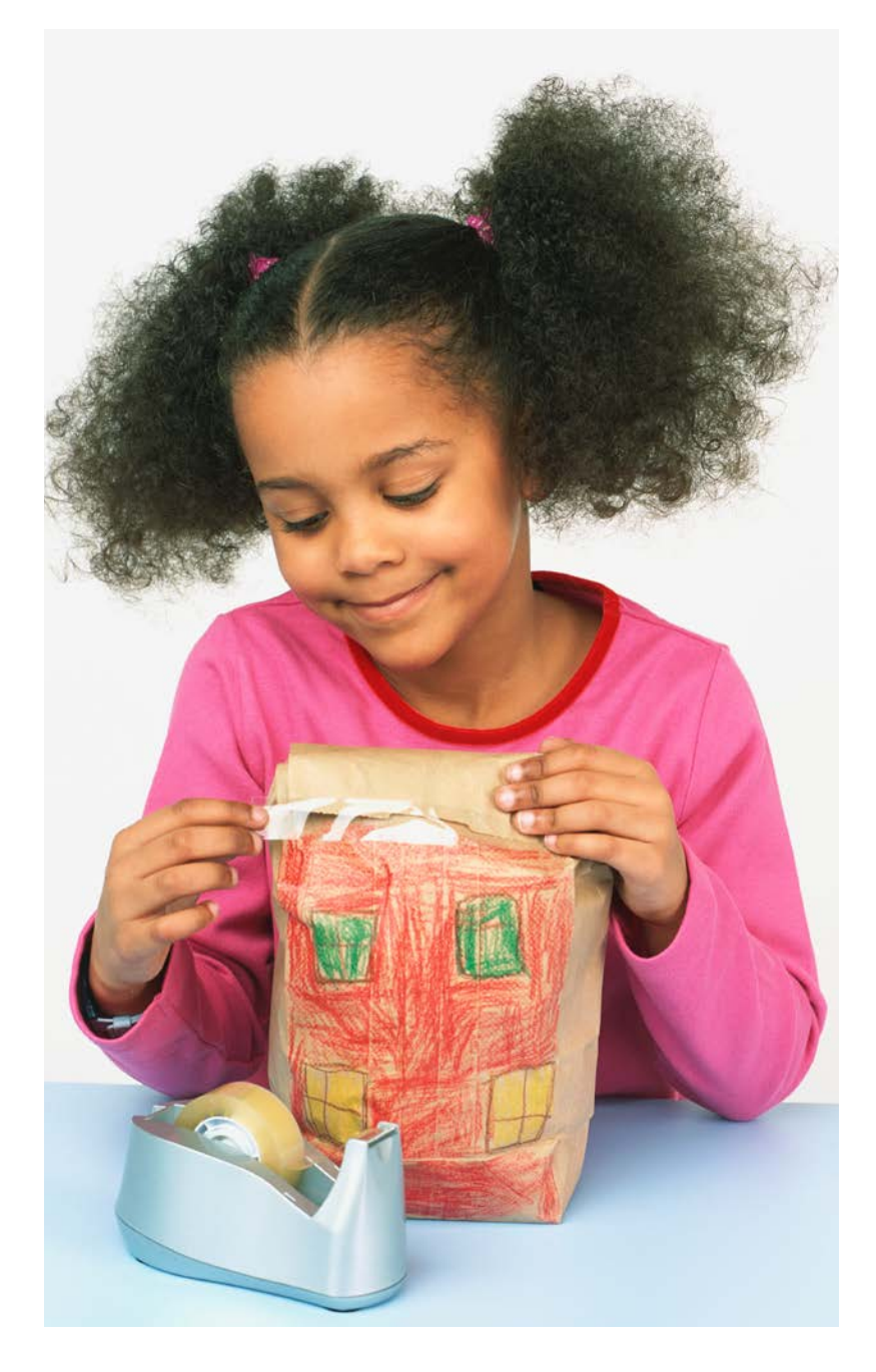
You can tape paper.